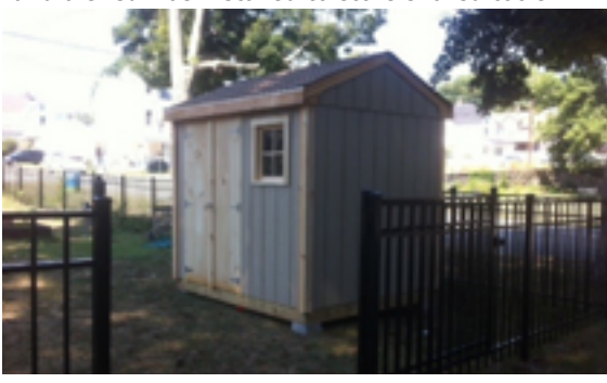
Youth & Community Service Projects

The community garden continues to grow. 12 new beds were constructed (bringing the total to 48), and a shed was installed to store shared tools.