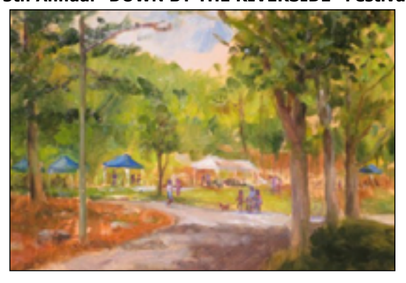
Saturday, October 17 "SCENES FROM RIVERSIDE PARK" Reception at The Gallery at Firehouse Square